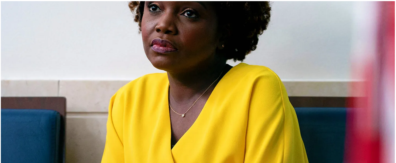
White House Press Secretary Karine Jean-Pierre listens as National Security Advisor Jake Sullivan speaks to reporters in the Brady Briefing Room of the White House in Washington, DC, on May 18, 2022.