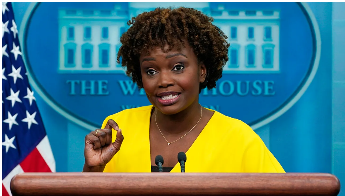
White House press secretary Karine Jean-Pierre speaks during the daily briefing at the White House in Washington, Wednesday, May 18, 2022.

across several administrations to address disinformation that threatens the security of our country is critical and that will indeed continue."